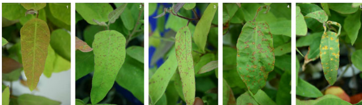
Figure 1 Rating scale for assessment of resistance to Puccinia psidii on the spotted gums ( Corymbia taxa) with five classes of severity based on ratings developed by Junghans et al. (2003b). From left to right: 1 = hypersensitive reaction with yellow flecking; 2 = hypersensitive reaction with necrotic lesions and no evidence of pustules with uredinia; 3 = small pustules <0.8 mm in diameter with 1–2 uredinia; 4 = medium pustule size 0.8–1.6 mm diameter with up to 12 uredinia; 5 = pustule size >1.6 mm in diameter with 20 or more uredinia on leaves, petioles and/or shoots.

Genetic parameters were approximated using estimates of the causal components of variance from a mixed model fit with ASREML (Gilmour et al. , 2009), assuming the provenances sampled for this experiment were randomly selected races within each Corymbia taxon. Two separate analyses were undertaken; the first used a multivariate analysis including CCV, CCC and CH while the second set of univariate analyses considered each taxon separately. The multivariate analysis included all taxa, as CCV and CCC are taxonomically similar subspecies and CH could not be distinguished from CCV using molecular genetic approaches (Ochieng et al. , 2008). Therefore, data from these populations were analysed jointly to estimate genetic parameters for the greater Corymbia complex. The statistical model used